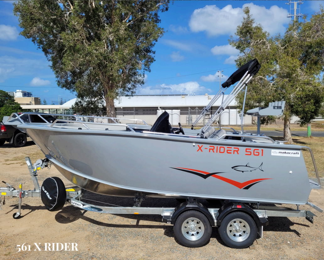
561 X RIDER